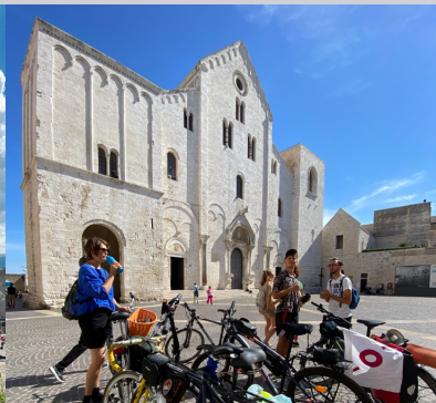
BARI AND MURGLIA | SOUTH OF PUGLIA